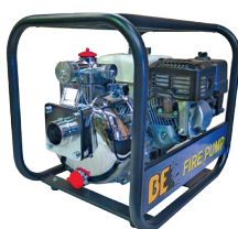
HIGH PRESSURE FIRE PUMPS