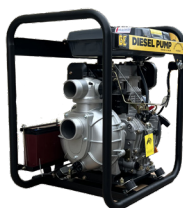
TRANSFER PUMPS WATER MOVERS