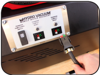
Transfer pump plug