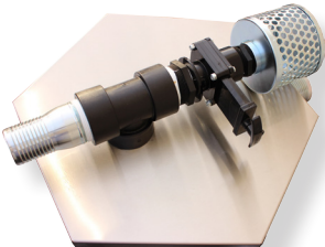
Air throttle valve