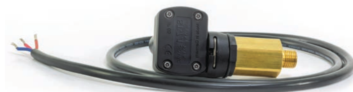
Connection cable: Length of 950 mm

Identifier: A red ring marks the switchpoint of 25 bar and black for 40 bar.